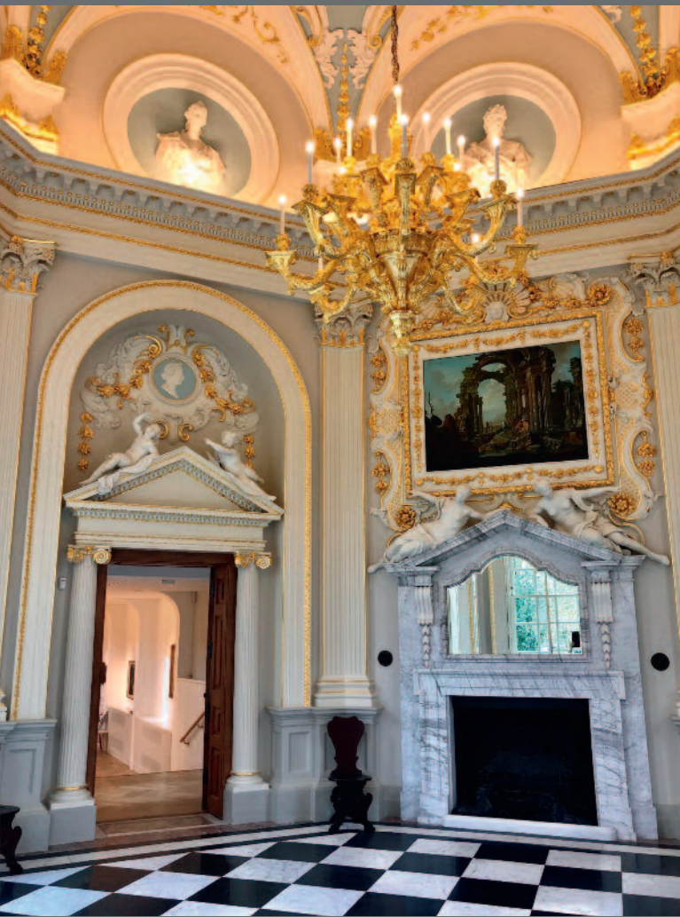
The Octagon Room, Orleans House (Ricky Pound)