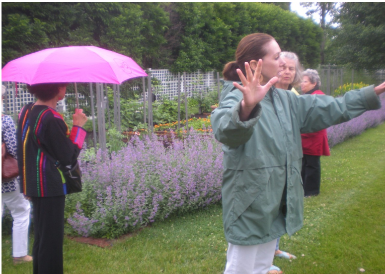
garden at Weatherstone