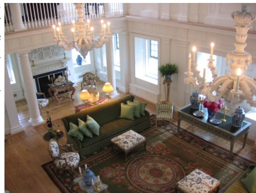
interior of Weatherstone

A traditional rowing clubhouse was the last stop. We enjoyed a lovely lunch at this restaurant, called the Boathouse.