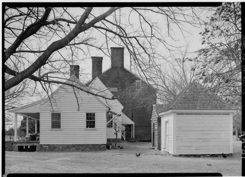
Brownsville Plantation, c. 1810