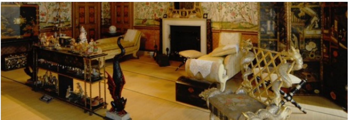
Chinese room at Burton Constable

If you would like to take part in the trip to the East Riding of Yorkshire, please call the AFGG office at 212/991-9191 or e-mail us at office@americangeorgians.org . Details, including the cost of the trip, are not yet available, but we will be happy to let you know as soon as they are.