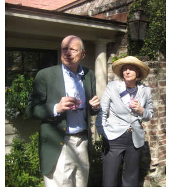
cocktails in Carolina low country

cocktail reception, Wednesday, September 22, 2010, 6:00