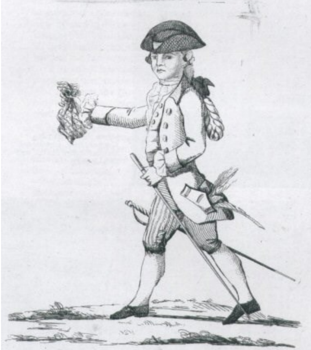
The Upper CILAPTON MACABONI Ped word is not by Rowly 39 Strong Mail ? 1712.