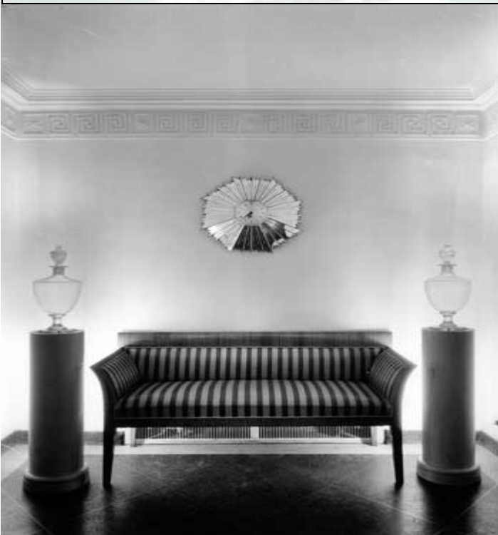
Lobby on East 72nd Street, 1935

Watch for news of the day trip to Edgewater and Montgomery Place, which has been moved to the spring. Additional information will be sent as soon as the new date is fixed.