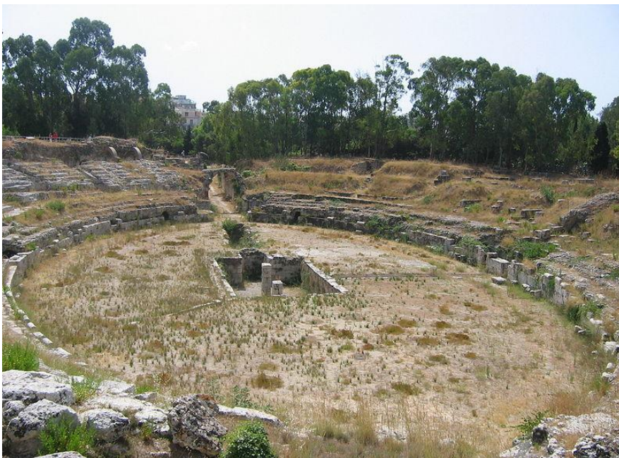
Roman amphitheater at Syracuse