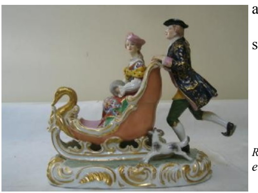
Ralph's folly, above eighteenth-century winter scene