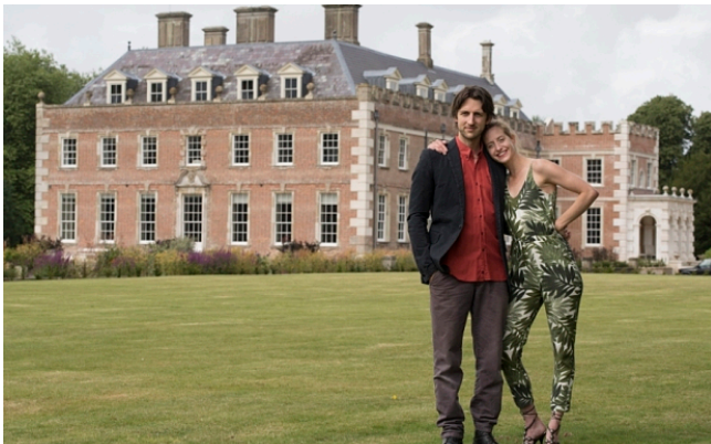
St. Giles House