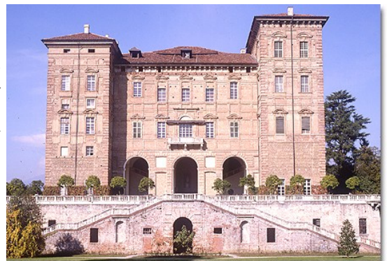
above right: Palazzo Madama; above left: Castello di Masino right: Castello Ducale d'Agliè