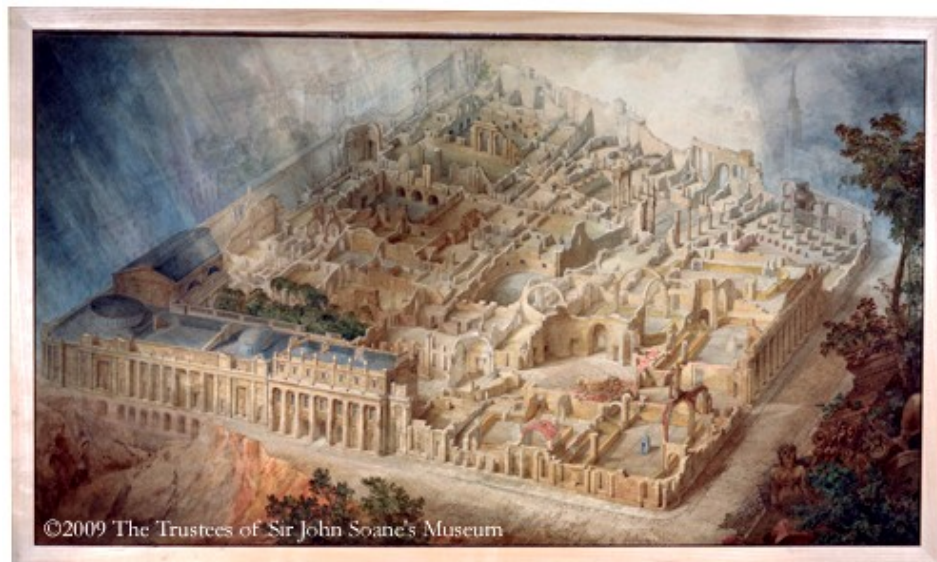
Bird's-eye-view of the Bank of England (Sir John Soane's Museum)