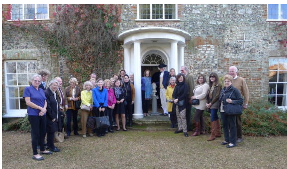
Chinoiserie folly, above Norfolk trippers, October 2014